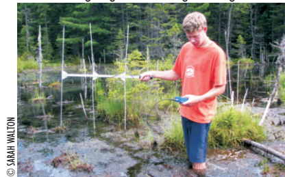
Radio tracking a Blanding's Turtle