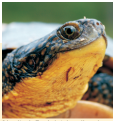
Blanding's Turtle bright yellow throat

Refer to page 54 to view descriptions and photos of the four species of turtles found in Atlantic Canada: Painted Turtle, Blanding's Turtle, Wood Turtle and Snapping Turtle.