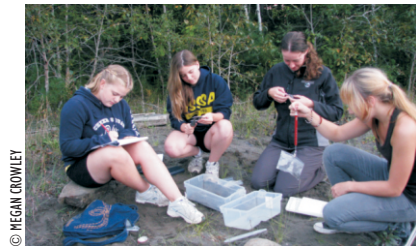
Volunteers weighing and measuring hatchlings